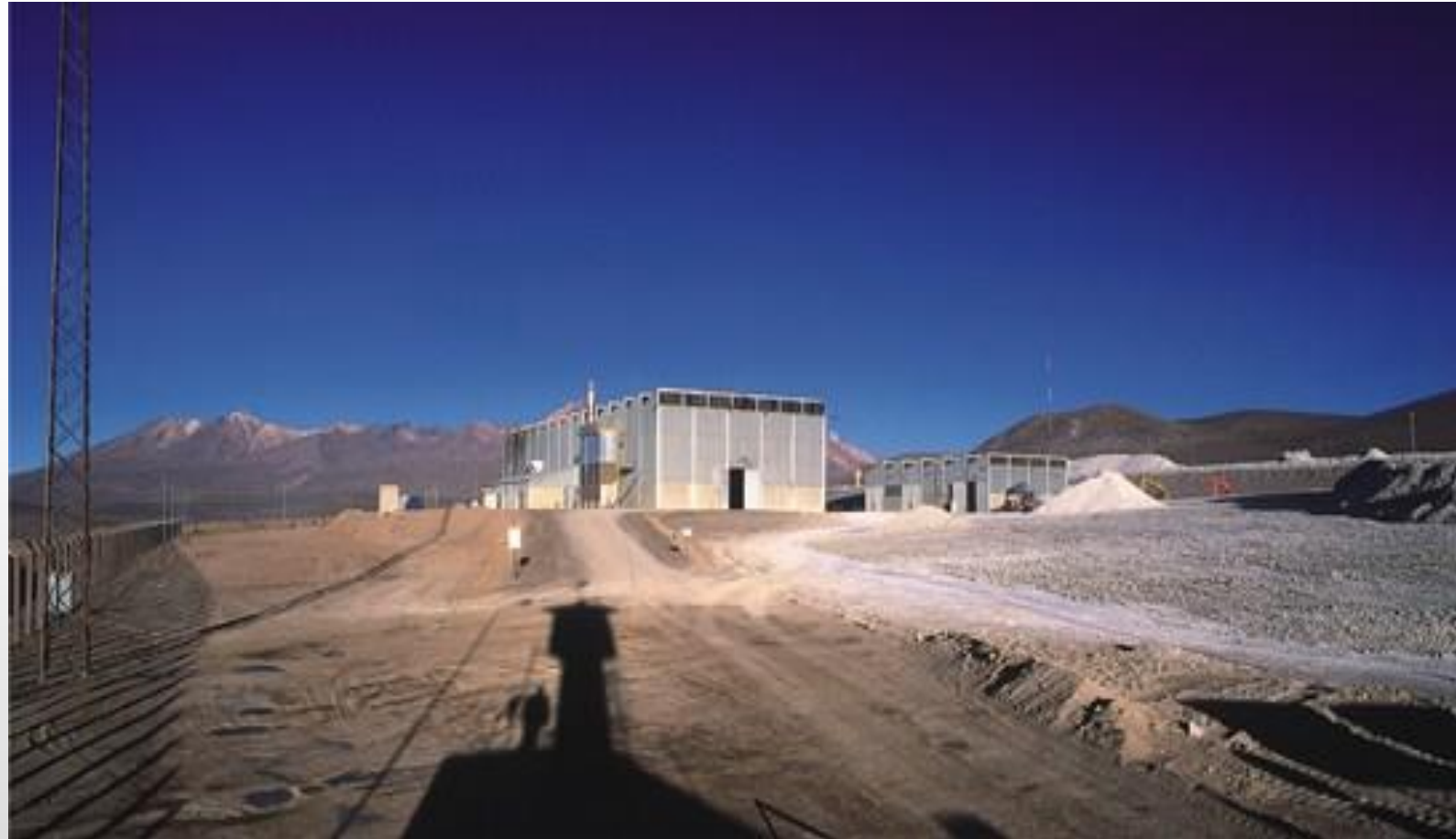
PLANTA SALINAS: MOLIENDA Y CALCINACIÓN