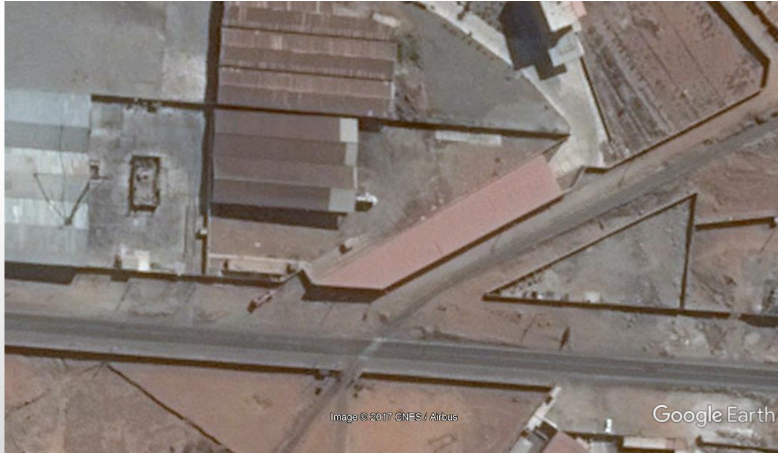
Almacén de Matarani: Exportando mineral a escala industrial