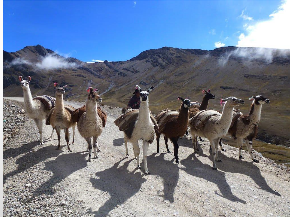
EL ORIGEN DE NUESTRO LOGO