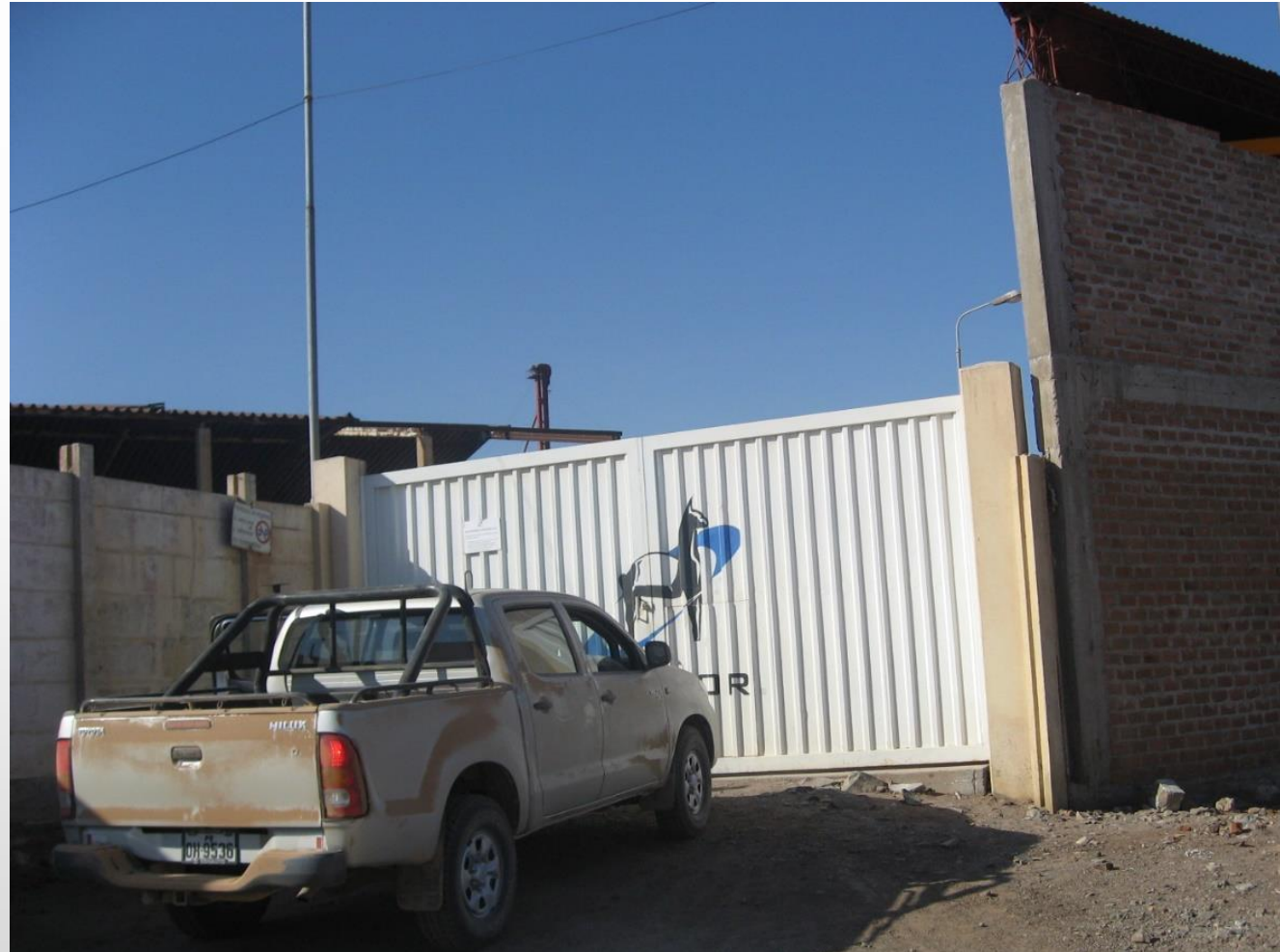
Almacén de Matarani: Exportando mineral a escala industrial